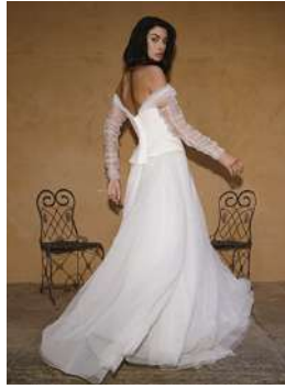
THE HARLEY TULLE TOP