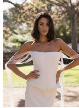
THE HARLEY BODICE