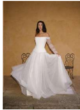
THE HARLEY TULLE SKIRT