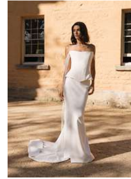
THE HARLEY CREPE SKIRT