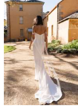
THE HARLEY CREPE SKIRT