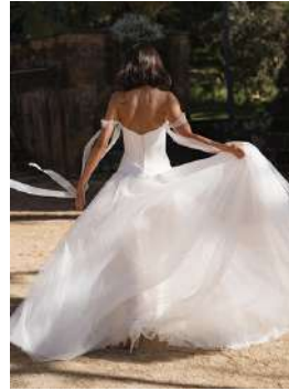
THE HARLEY TULLE SKIRT